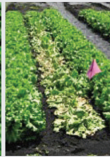
Center row inoculated