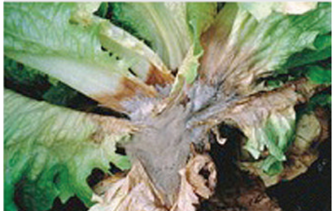
Grey mould ( Botrytis cinerea )