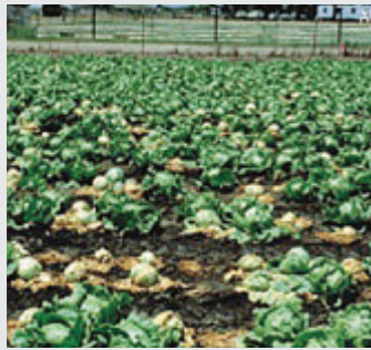
S. minor in crisphead lettuce