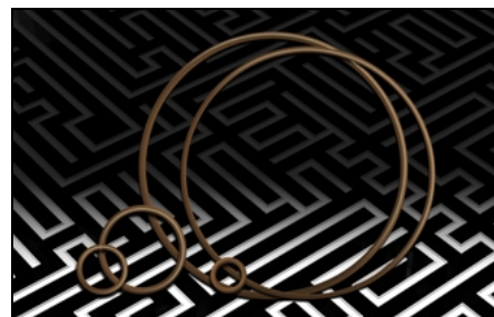
Kalrez® 9300 parts are based on a proprietary crosslinking and mechanical reinforcement system which is only available from DuPont.

Kalrez® 9300 exhibits excellent resistance to oxygen and fluorine-based plasma and etch process chemistry. It also offers very low metals content, excellent thermal stability and mechanical strength, and is well suited for both static and dynamic sealing applications. A maximum application temperature of 300°C (572°F) is suggested. Ultrapure post-cleaning and packaging is standard for all Kalrez® 9300 parts.