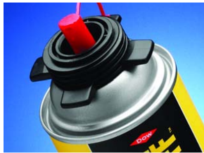
Cleaner with red spray nozzle attached.

Uncured GREAT STUFF PRO™ Insulating Foam Sealant and Adhesive can be removed from the adapter and the gun's exterior surface with GREAT STUFF PRO™ Gun Cleaner, using the red spray nozzle attachment.