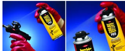
Remove uncured foam from gun. | Remove uncured foam from gun adapter on can.

Cured foam should only be removed from the adapter using a blunt tool, such as a piece of wood. Do not attempt to scrape cured foam off the adapter with a sharp object; this can scratch the adapter coating and cause foam to get in the cracks and scratches, impairing proper loading of cans and leading to eventual gun failure.